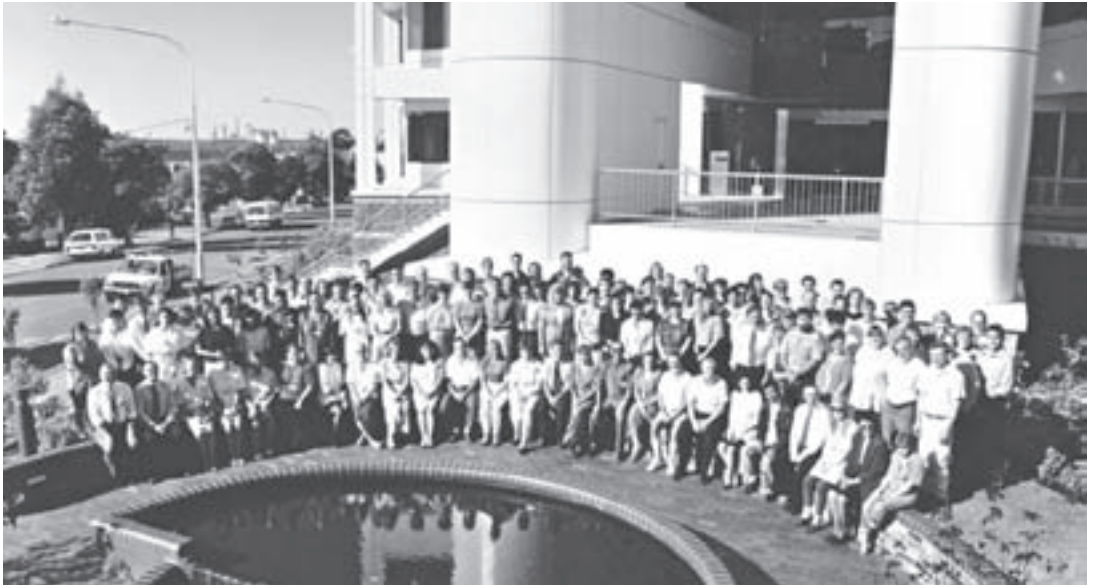
Staff of the ATO's Wollongong branch gather for a group photograph to mark its opening.

Today the ATO is recognised as a world class tax administration and a leader in many aspects of revenue collection and distribution. This journey began a hundred years ago when a handful of men met to plan the introduction of a new tax to the newly-created nation and it has been achieved since then through generations of hard mental and physical labour. The Australians who have achieved this were people just like you, but what they did has helped make us what we are today.