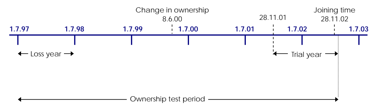
Figure 2: Ownership test period

Section 165-10 provides an alternative qualifying test that requires the company to meet the conditions about carrying on the same business.