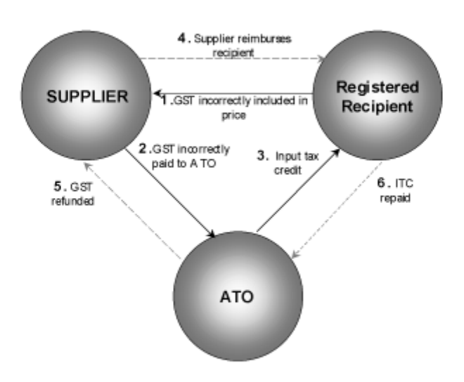
Figure 1 The round–robin effect of reversing transactions between registered entities (refer paragraph 17)

17. The ATO recognises that reversing transactions and revising every activity statement to correct errors of this particular type amounts to a paper 'round robin' among the registered recipient, the supplier, and the ATO. Significant compliance costs can be incurred with no change to the financial result. Figure 1 below illustrates the effect. Accordingly, the ATO has accepted an alternative solution that results in no detriment to GST revenue.