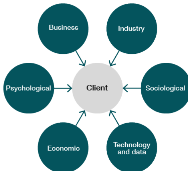
Diagram 1: Factors that influence client behaviour