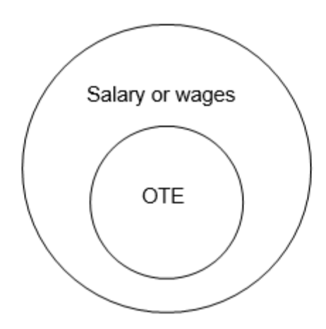
Diagram 1: Relationship between OTE and salary or wages